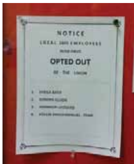
An AFSCME local posted the names of hospital workers who exercised their rights and left the union.