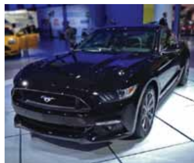
2015 Ford Mustang

U.S. Sen. Debbie Stabenow wasn't far behind. The Lansing Democrat who famously told The Detroit News editorial board that she could feel global warming when she flies, also kicked the small car's tires and climbed in to see the fruits of her and her colleagues' government mandates.