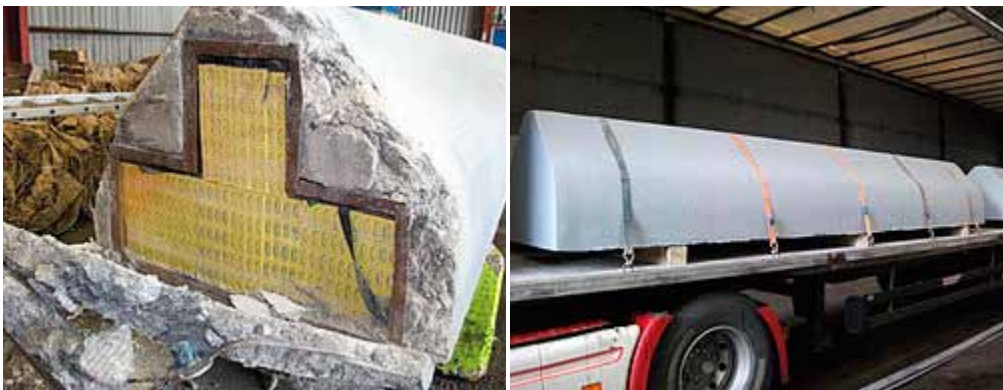
Graphic 9: Jin Ling Cigarettes Smuggled in Concrete Barriers